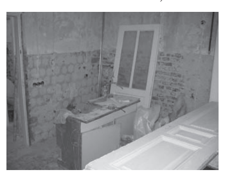
Our kitchen under construction

stayed in several places, one in particular that afforded a variety of memorable adventures. Large and cave-like, with old red carpets and dusty furniture, this apartment was the first place where we really unpacked and settled in. Every morning Joshua lugged buckets of water back and forth from the kitchen faucet to the bathroom tub until we had enough hot water to take a bath. We ran the blow dryer only after checking to make sure it was safe. Too many lights on, or just one other appliance going at the same time would flip the breaker. I don't know how many times Josh had to climb precariously on top of a wardrobe to reach the breaker box, some twelve feet off the ground. We played games together in the poor lighting and