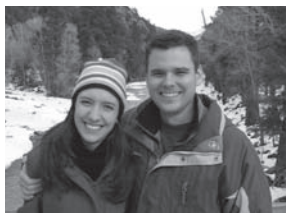
Best friends spending an afternoon out ♥

Our Bible Correspondence School is growing almost faster than we can keep up with. We are very grateful to now be sending lessons to over 200 students in L'viv, the Carpathians and throughout Ukraine. More lessons are in development and we are very pleased to see that they are being well received by the Ukrainians. We receive lots of letters from students as they return their lessons, and many talk about how they can't wait to get their next lesson. One lady even photocopied her friend's lesson because she didn't want to wait on hers! It is a great blessing to see the Word of God at work in people's lives. As the Scriptures say: "The entrance of thy words giveth light; it giveth understanding unto the simple." (Psalm 119:130)