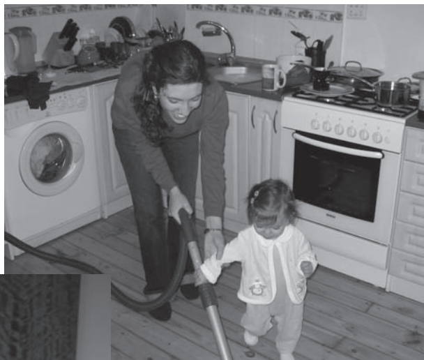
Helping Mommy is so much fun!

During the Christmas holidays, God opened the door for us to fly home to the States and visit both sides of our