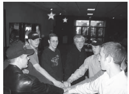
The CMO 2006 Reunion in Texas