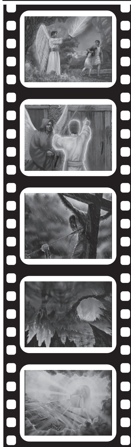
The Light of the World film is produced by Chick Publications. For more information, please visit their website: www.chick.com