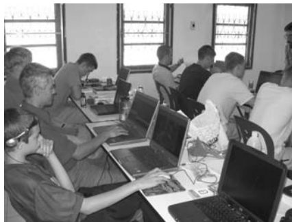
Twenty-first century Bible classes: "Good morning class. Please scroll with me to the book of Romans..."