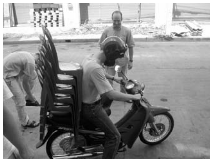
The most versatile cargo vehicle in southeast Asia: the 100cc Honda motorbike.

MEET THE BALDINGS (Continued from page 1)