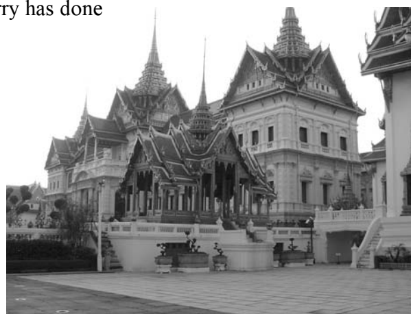
One of the many ornate buildings inside the Royal Palace in Bangkok