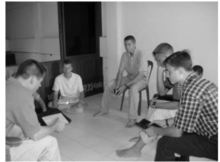
Every day at NTI begins with morning Bible reading at 6:10am.

One of the primary reasons for this step, is that young men will