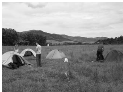
The CMO men break camp and prepare to hike to their next village.

The start time for the film had been announced for 6:00pm, and at ten minutes till, the hall was completely empty except for our team. Finally, just a few minutes before we were to start, a few older men stepped into the room. I could hear some others standing around outside, so I decided to make an announcement over the microphone. "Good evening, everyone! We're about to begin our showing tonight. Please come in and find your seats." As I continued my introduction, explaining about the film and our ministry, more and more people walked in. By the time we started the film there were about 25