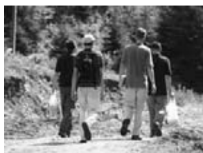
The CMO team hikes into a village to distribute copies of Good and Evil.