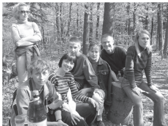
A group of Ukrainian believers gathers in the woods for an evening worship service.

Perhaps one of the most effective means of teaching the Bible to people who are spread over a large geographical area is through correspondence courses. This is also a very good means of church planting.