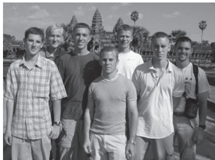
The single students and I spend an afternoon at Angkor Wat while renewing our Thai visas in Cambodia.