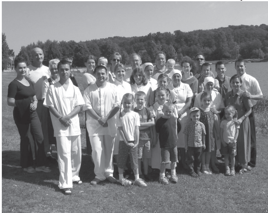
A group of believers from Bible Baptist Church in L'viv, Ukraine, gathers for a baptismal service at a nearby lake. (August, 2003)

Beginning this summer, it is our vision to open that same door for other young men. One of our major goals in doing this is to employ the Biblical method of training through discipleship over and