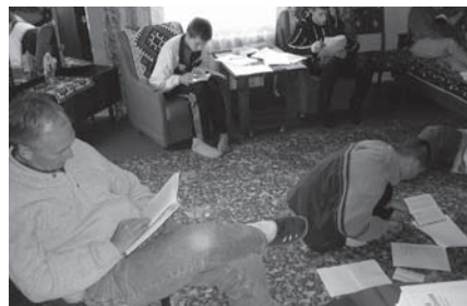
Study time at Bible Camp

guys had two hours to do a thorough study on the word righteousness. Because the exhaustive concordance of the Ukrainian Bible is not yet complete (it is due on the market this year) we gave them computer print-outs of all the references containing the word "righteousness." They were to look up each usage of the word, and then answer such questions as: "What is righteousness?" "Why is righteousness important?" "Can a sinner be made righteous?" etc. Over the course of the week, they also did studies on the words "baptism" and "for-