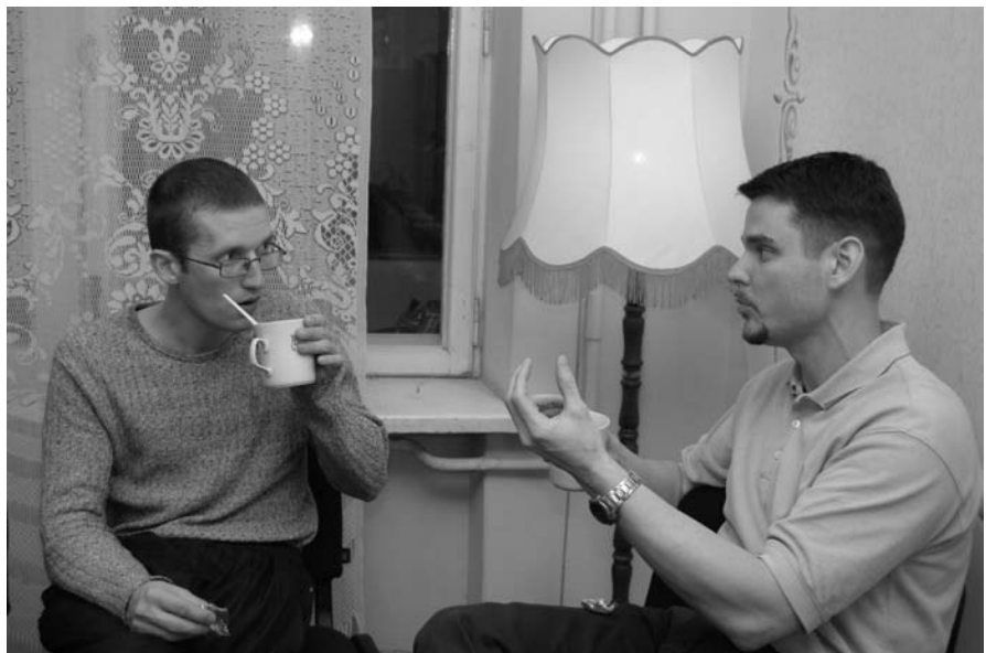
After our Bible lessons, most people stick around to chat and ask questions. We have many open doors right now for sharing the Gospel.