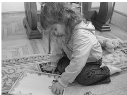
Working a puzzle