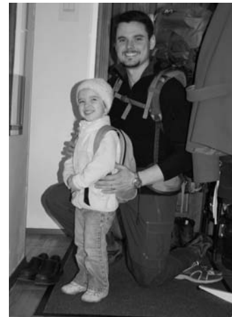
Heading to the woods with Dad