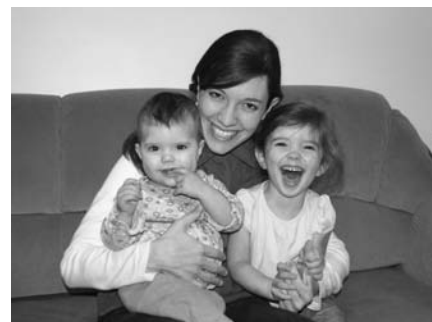
Mommy and her girls

ALL ARE UNDER SIN (continued from page 3)