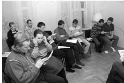
Several of our Bible students attending an ABS session.

At this point, when the self-righteous have been humbled, when the religious and the philosophical have been exposed for the fools they are, when all human hope has been taken away, the audience is finally ready to hear of Grace: “ But now the righteousness of God without the law is manifested, being witnessed by the law and the prophets; Even