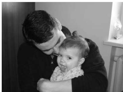
Snuggin' with Daddy