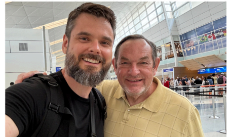
2024 has been a year of sorrow. Yet, in the midst of our trials, God has brought joy and new life. Check out this report on our blog for more photos and captions!