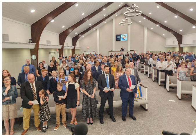
What an encouragement to see so many friends and family supporting us with their presence at Mom's memorial service!