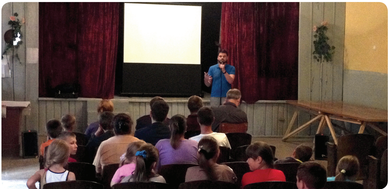
Preaching the Gospel after a film showing in the Carpathian village of Scherbovets.

When I first came to Ukraine over 15 years ago, my initial goal was to learn how to speak the Ukrainian language. I knew that if I was to effectively communicate the Gospel to people here, I needed to be able to talk.