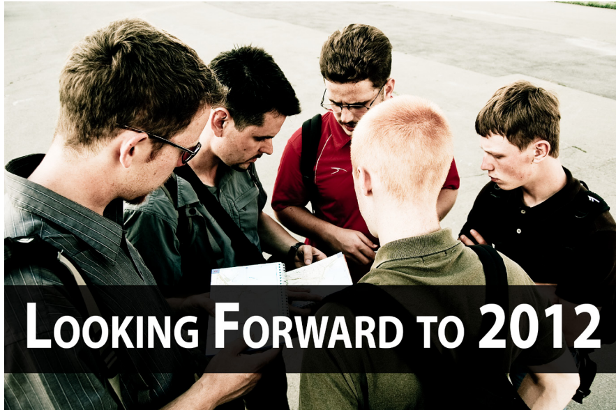
The CMO team consults a map before handing out Bible literature.

CMO 2010 is over, and we are once again rejoicing as we witness the increase God has given. We were able to show the film and preach the Gospel in 10 villages this summer. We also did literature blitzes in 7 new cities we have not visited before. Over the course of the project our team distributed approximately 160,000 tracts and other forms of Bible literature. Since CMO 2010 commenced on June 1, 168 new students have enrolled in our correspondence Bible course. This year we also made our first trip to Eastern Ukraine, where we did a ten-day literature blitz in several