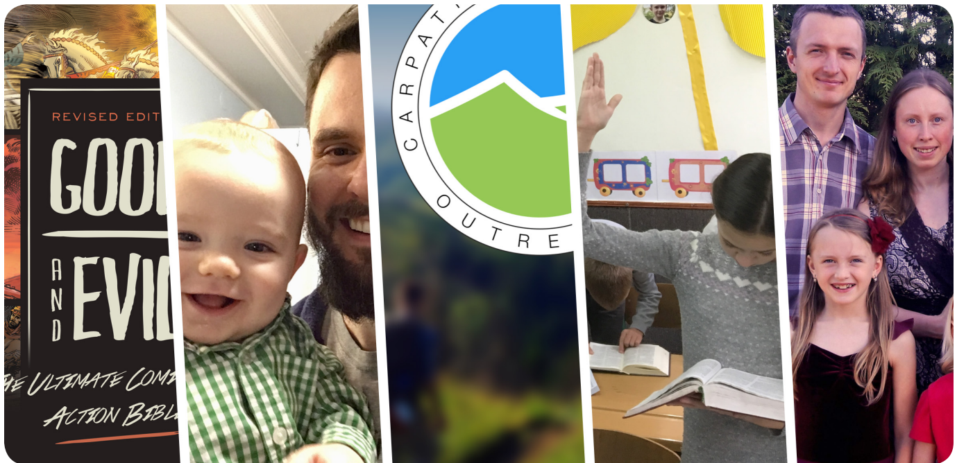
Good and Evil, family news, our new ETO staff family, CMO 2018 – where do I start? Two pages never seems enough to fit in all the news. But this time, I'm going to try...

There are months when so much is going on, it's hard to find time to write newsletters! God is blessing the ministry and keeping us busy with progress on a variety of fronts. In this issue, we'd like to give you a little grab bag of several mini-reports. Let's dive in!