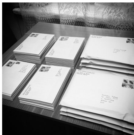
Graded and ready to mail!