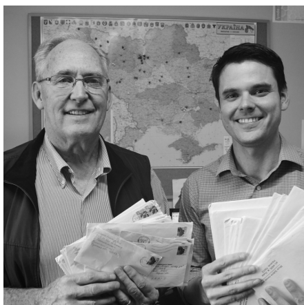
...leads to reaping these.