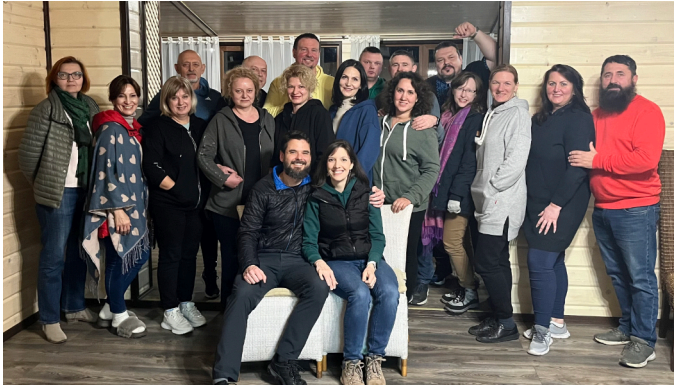
We recently had the wonderful privilege of leading a marriage retreat for couples from our church in L'viv.

There are days when things appear almost peaceful. We move about the city, living what seems a normal life, and we almost forget that there's a war on. Then the sirens go off again, reminding us why we pray for peace and liberty in Ukraine.