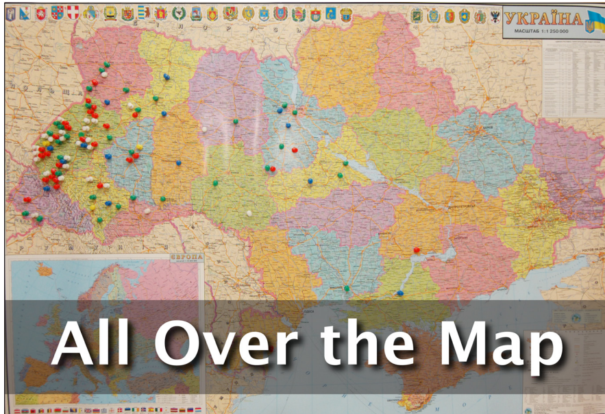
A map showing each city/village in Ukraine where we have students enrolled in our Bible course.

The image above is a picture of the map hanging in our ministry office here in L'viv. Each pin represents a town or village where we have students enrolled studying the Bible. Denise Hutchison recently gathered this info from our student tracking system and set up the map. (Thanks, Denise!) At present, we have 406 students in active enrollment, and with CMO approaching, we're expecting that number to rise!