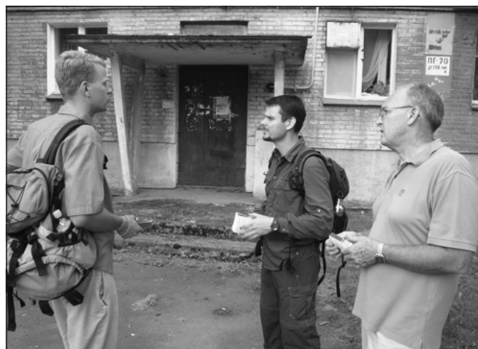
Passing out CBC invites in Chervonograd

Bottom line: there are lots of people out there who are open to studying the Word of God and ultimately hearing the message of Christ. It's just a matter of finding them, and breaking through the cultural barriers that so often separate missionaries from the people