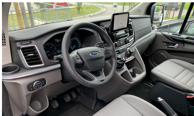
Bluetooth, USB ports front and back, Apple Car Play, AIR CONDITIONING, rear camera, cruise control, and cup holders galore!

In addition to the NGJ fund-raiser, there were many other people who gave to us directly via PayPal and also through our church, Fairpark. We have a backlog of thank-you notes to write like you can't believe! In time, our goal is to reach out personally to