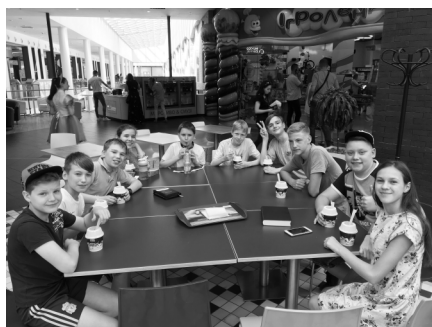
Once a month, we do our class at Forum Lviv — a mall across the street from the church.