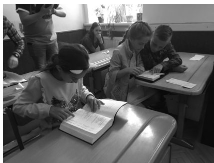
Searching for a passage during Sword Drills. These kids are getting pretty fast!