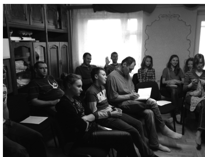
English Club attendance in L'viv has really been up of late. PTL!