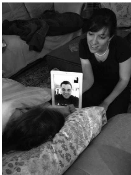
Tuckin' in my little girl from the other side of the world.

Father. Please pray that God would continue to soften hearts and open doors in Skole.