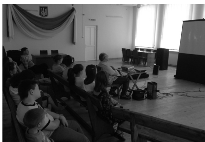
A film showing in the village of Myslivka – one of our first showings of the season.