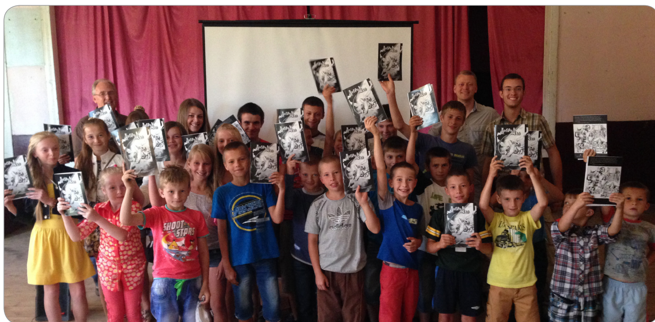
At a recent film showing in the village of Ilemnya (pronounced ee-LEM-nya) we had over 40 kids in attendance. Each of them received copies of Good and Evil Short plus starter packets for our Bible course.

Carpathian villages, though beautiful in photos, can be surprisingly dark places. Entrenched in centuries of religion and superstition, the people who live in these mountain communities often embody a sad yet all too common paradox: "They profess that they know God; but in works they deny him..." (Titus 1:16)