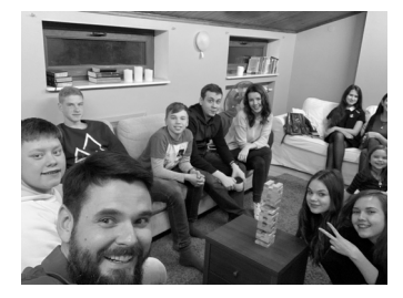
Our first home meeting with the teens from church

been coming to my class at church for a long time. For the home group, we decided to tackle a particular theme: a Biblical perspective on courtship and marriage.