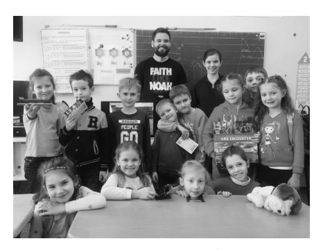
We shared the story of Noah's Ark with a group of elementary school students.