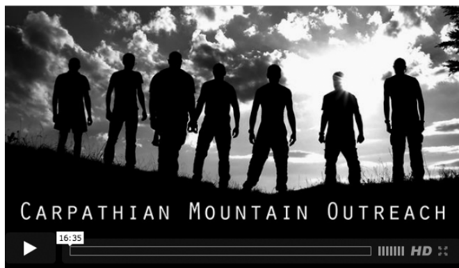
The CMO Movie gives an intriguing look at evangelism in Ukraine. Use it as a ministry tool to encourage others to get involved in short-term missions!