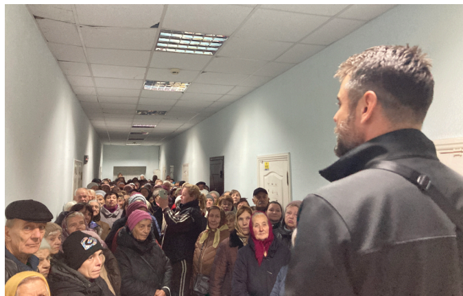
Preaching the Gospel in Zhytomyr

We first launched this program shortly after the start of Russia's full-scale invasion in 2022. At the time, donations allowed us to print 15,000 copies of the Good and Evil book,