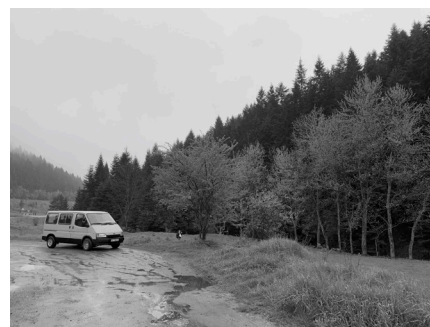
Scouting for a camp site in preparation for CMO 2019

Ukrainian is not too rusty, we'd love for you to read it!